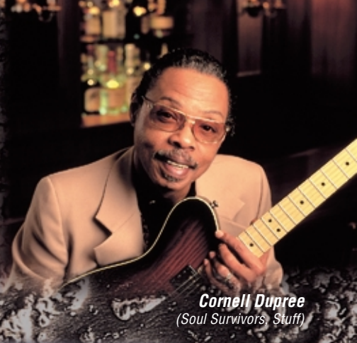
Cornell Dupree (Soul Survivors, Stuff)